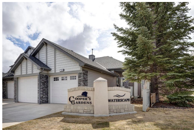
160-100 Coopers Common SW, Airdrie, AB

Refaced cabinet doors and drawers gleam in the kitchen, where a sleek moveable island invites culinary creativity. Hardwood flooring has been extended to flow seamlessly from the main living areas into the kitchen and two bedrooms, creating a cohesive, polished look. The main floor is a masterclass in functionality, with the kitchen leading to a spacious dining room, while the living room beckons with a cozy gas fireplace and patio doors that frame the deck's inviting views. A practical mudroom/laundry area connects to the double attached garage, ensuring convenience. Retreat to the primary bedroom, complete with a walk-in closet and a 3-piece ensuite, or host guests in the second bedroom with easy access to another full bathroom. Downstairs, possibilities abound. A spacious recreation room, bathed in natural light from two large windows, sets the stage for movie nights or game days. A third bedroom and full bathroom offer flexibility for guests or family, while an unfinished hobby space or workout room awaits your personal touch. Enjoy year-round